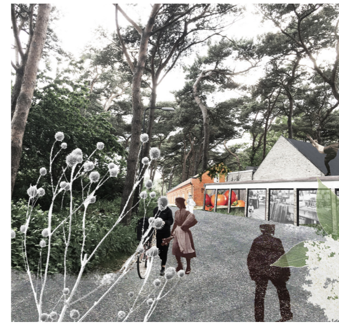
views _ living in the pine trees

Futur Trelleborg inhabitants will face a very privileged situation. The warm comfort of swedish's homes will face the refreshing and wild nature of the harbor. We think that this very particular confrontation should be conserved as « pure » as possible.