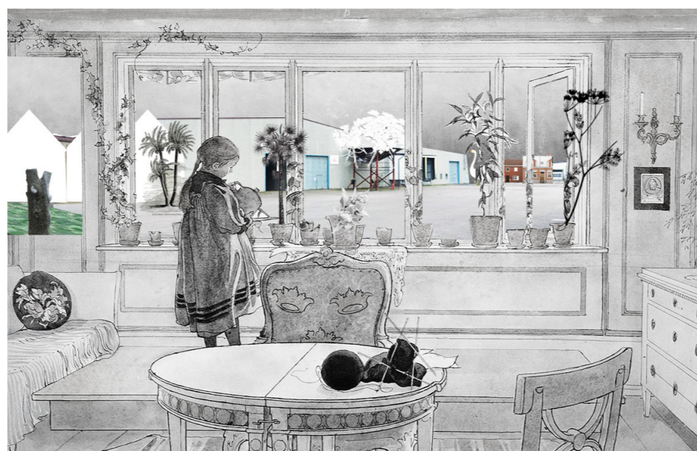
view _ a rich confrontation

The city would gain so much by delesting brussel of it's symbolic power.