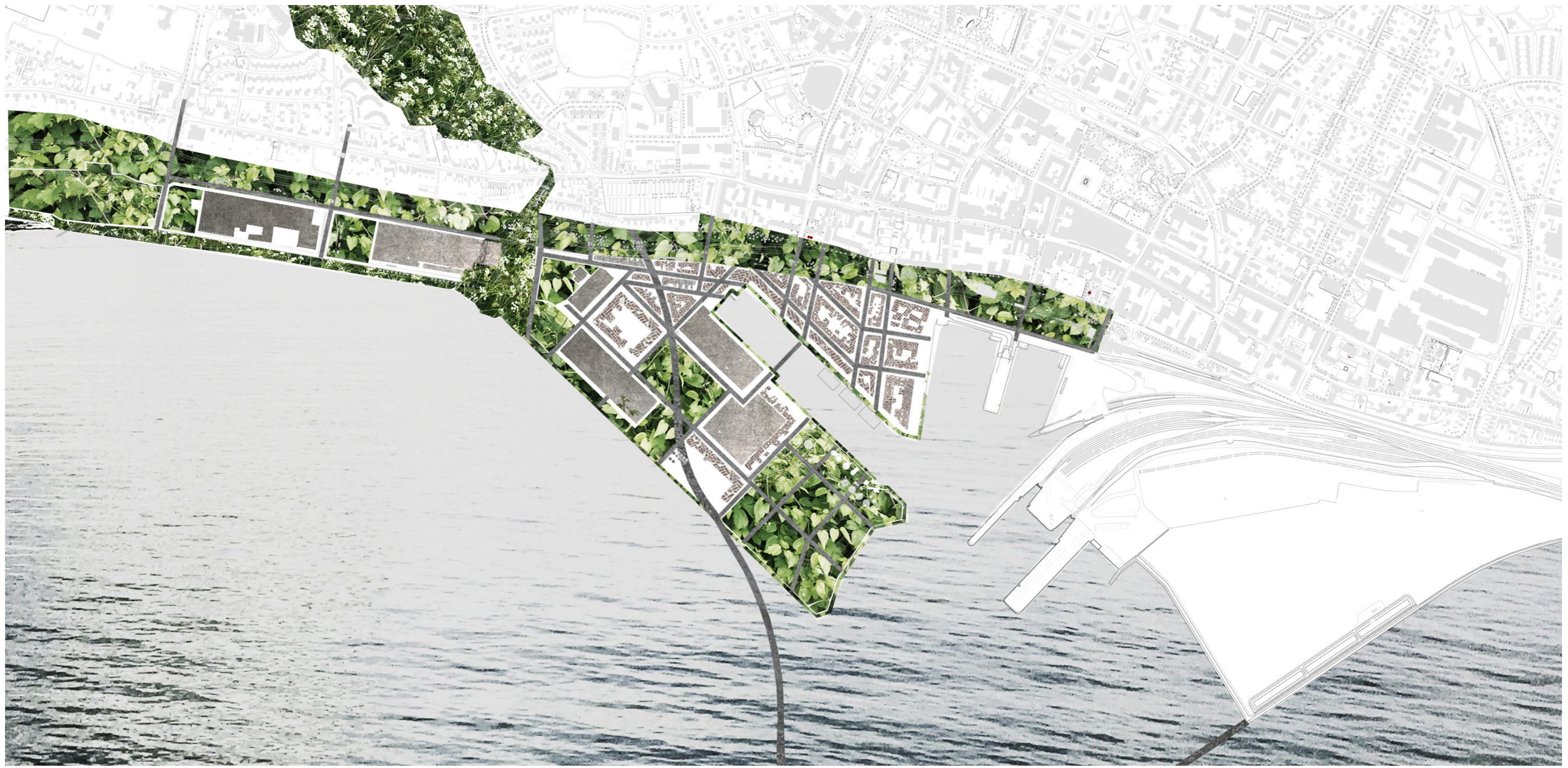
map phase 2_ 1:10 000