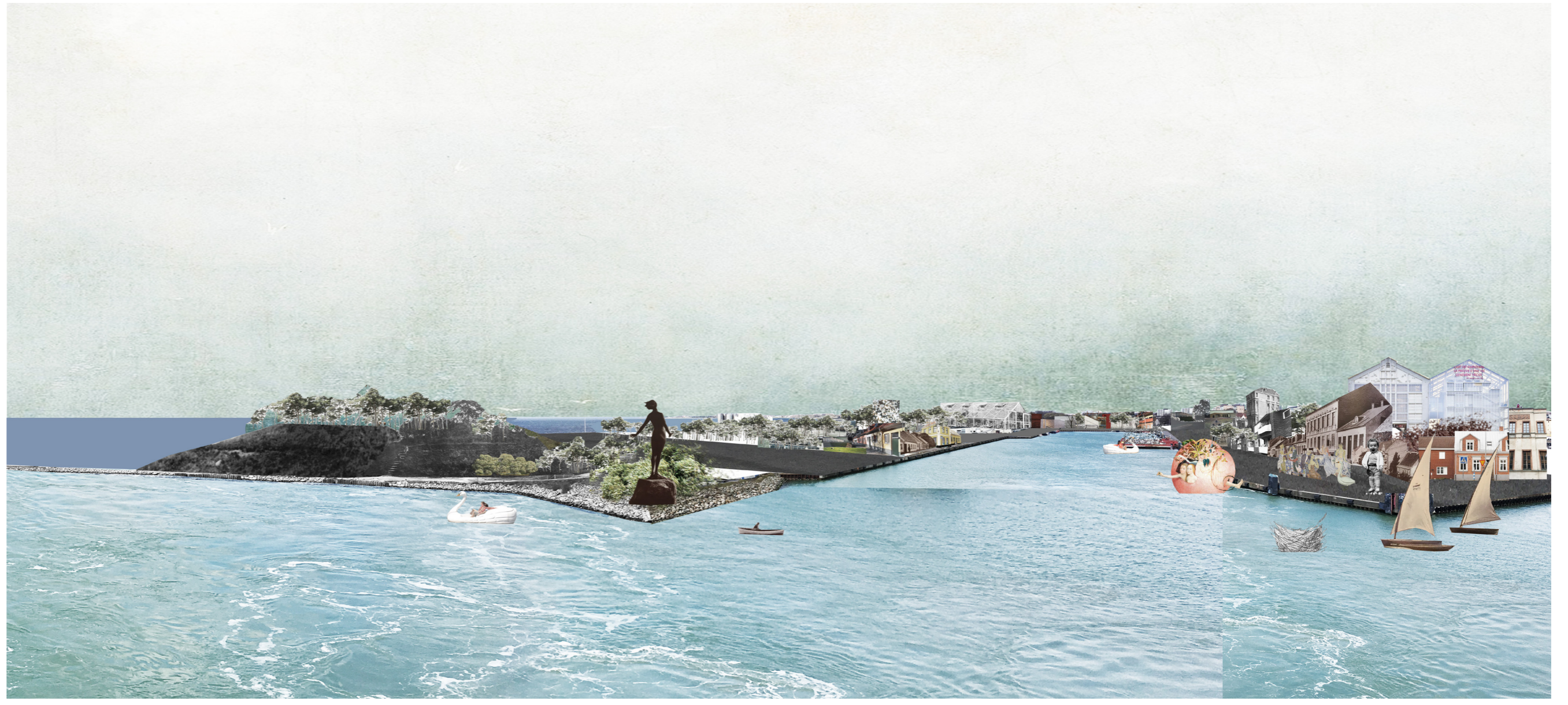
view _ a new city to come