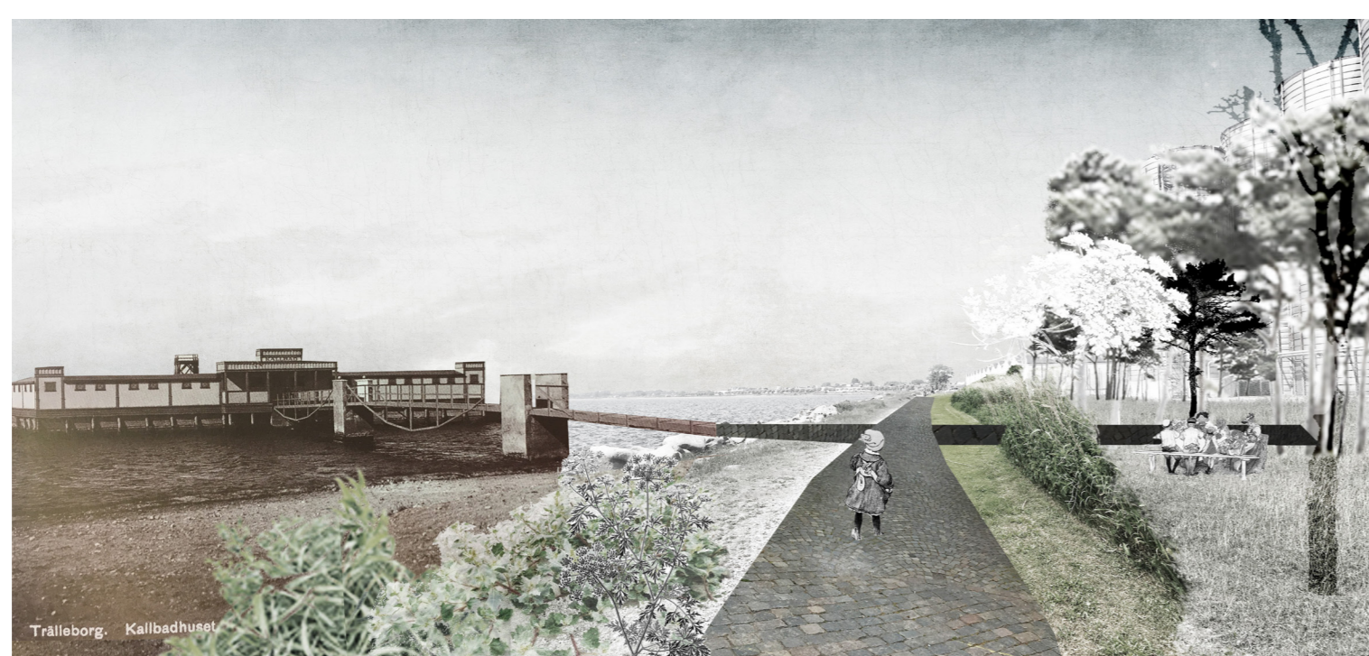
view _ the good old ways to relax

Living in a park on the shoreline. The pine trees make a protection from the wind, and show it by the forms they took. Thank to their roots, they don't need a lot of ground. Under them, bushes and lilac make a second protection.