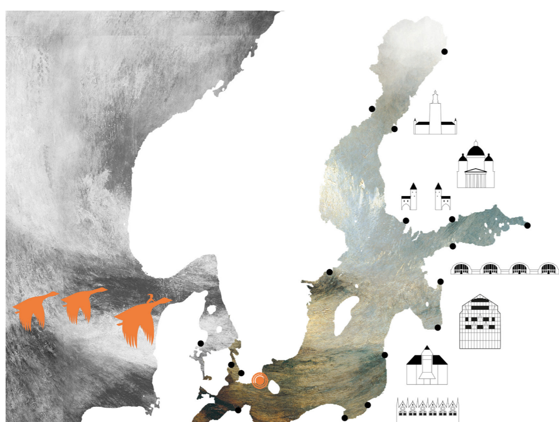
map _ the new baltic politic and migration center

Through it's very strategic geographical position we think that Trelleborg has to be geopolitically ambitious. Thinking throu this European region offers new development perspectives for the city. Thinking in common.