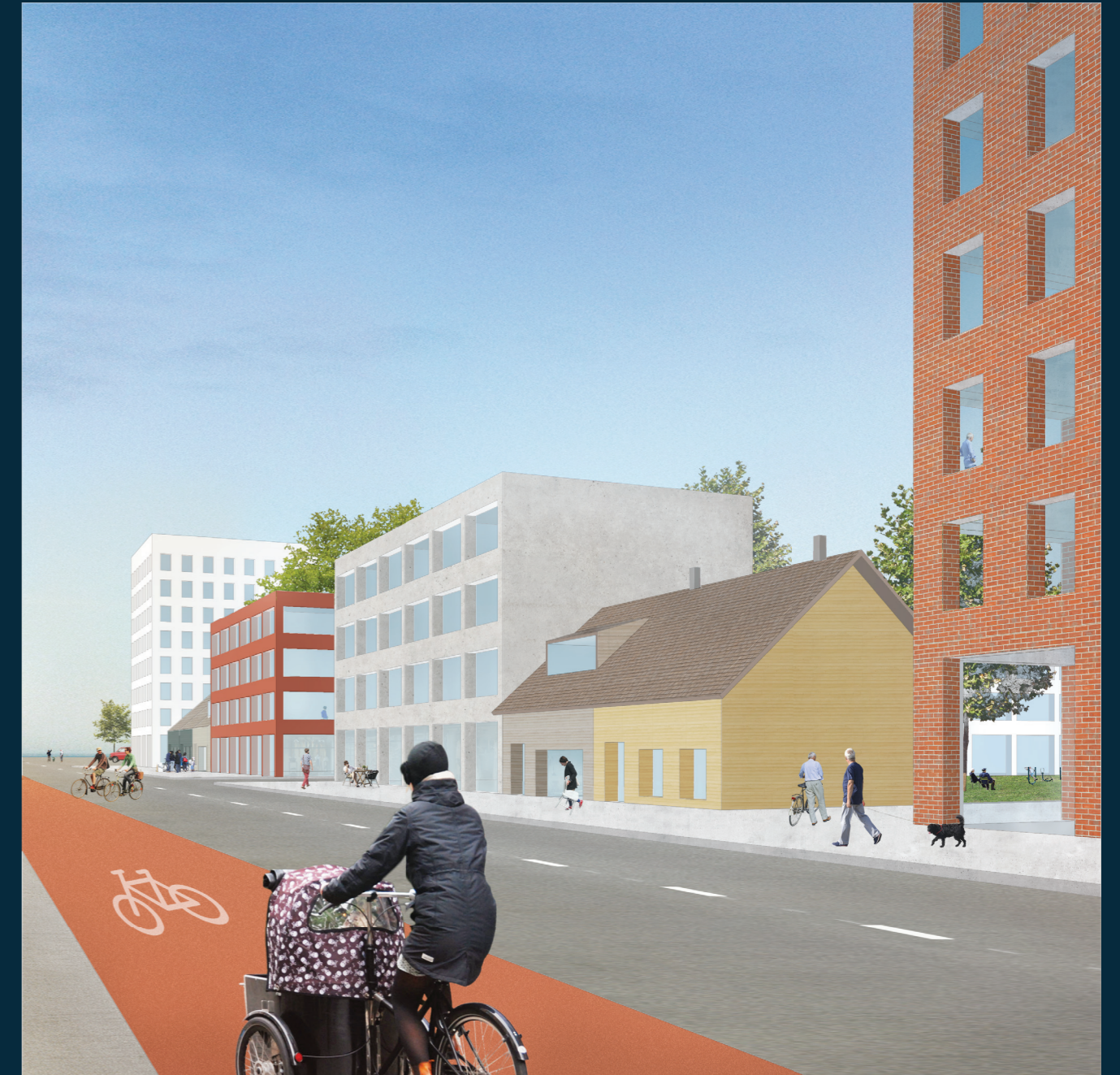
DIVERSE BUILDING TYPES The project maintains a diversity of building types in keeping with the existing urban fabric of Trelleborg. From small pioneer huts to towers with productive podiums, varied building heights and open urban blocks maintain views, while different building footprints allow for diverse possibilities in both living and working.