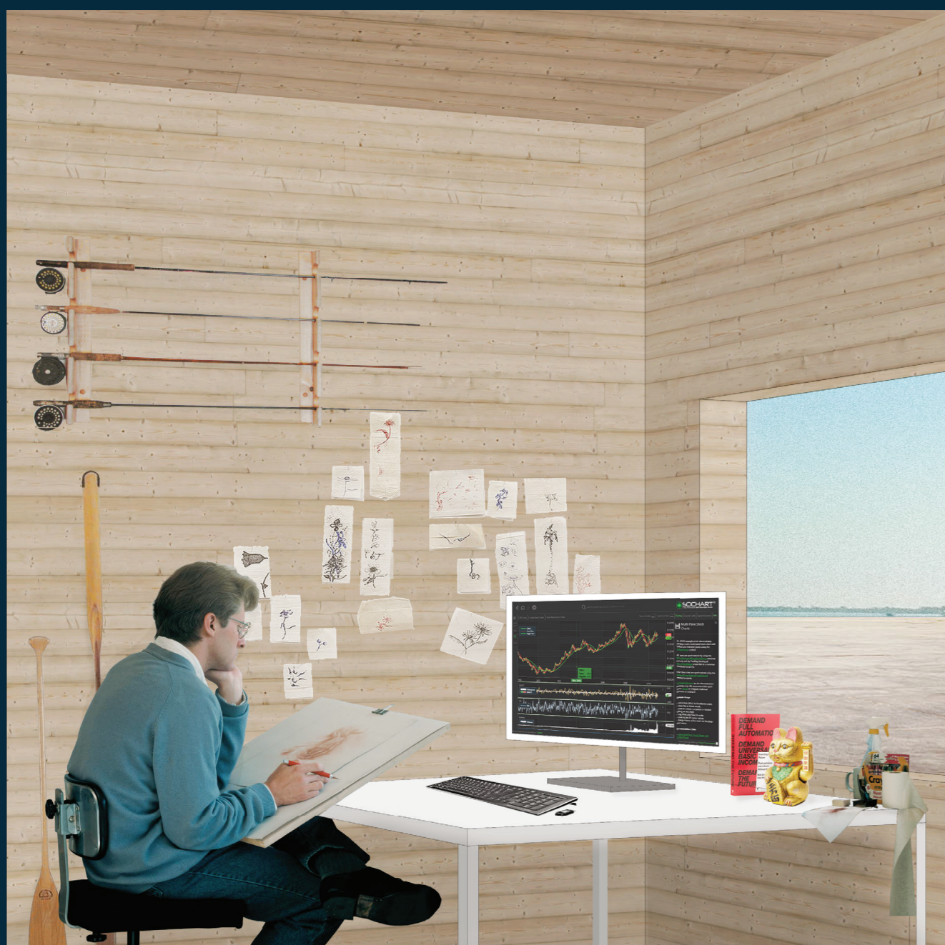
PRODUCE WORK The pioneering process produces guaranteed access to housing. At a time when housing costs continues to dramatically outgrow other household expenditures, access to housing allows the inhabitants the freedom and security to pursue meaningful work.