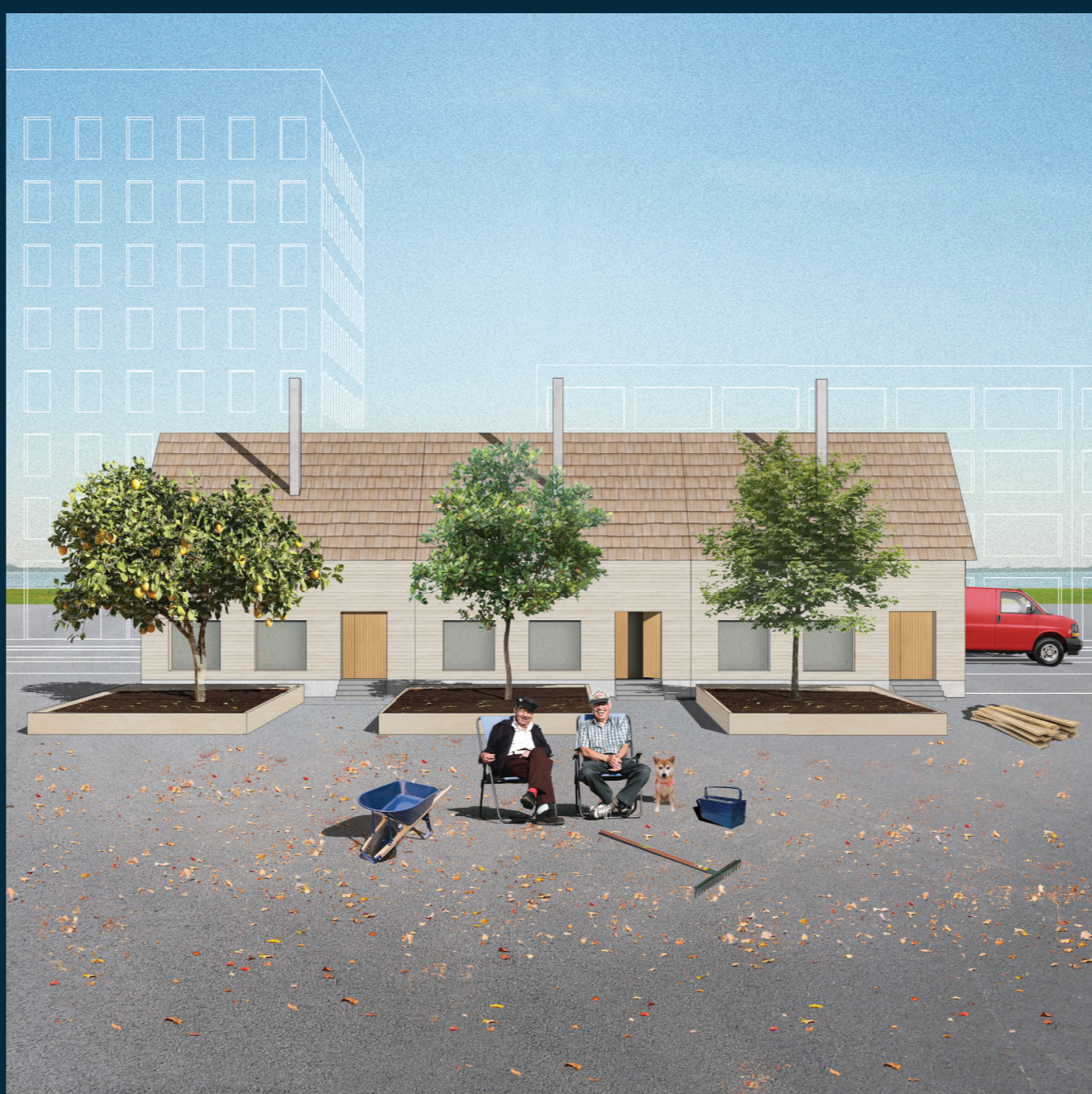
COMMUNITY The pioneers are a community with a dedicated and vested interest in the future of Trelleborg, embedding a productive ethos at the heart of Sjöstaden.