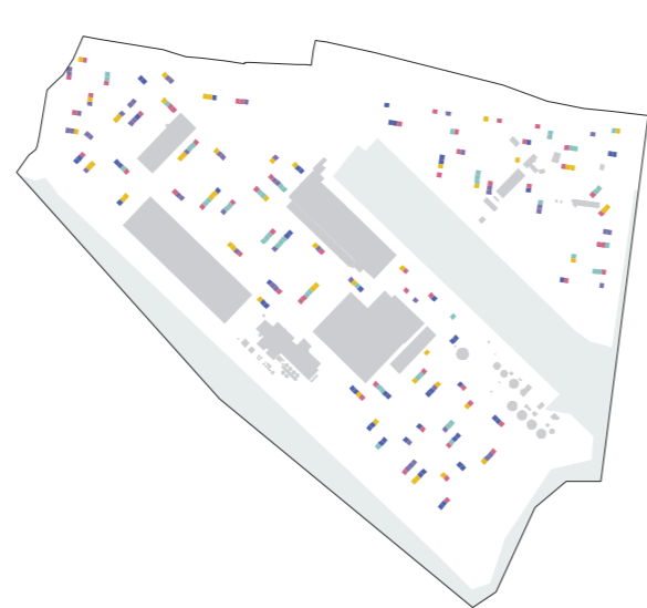
Pioneers colonize the entire site, scattered like confetti the pioneers establish a point grid - the clues for the city to come...