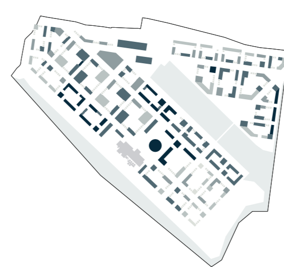
Additional development occurs gradually, complementing and strengthening the existing urban structure. Development does not occur in phases, but considers the entire project site as a whole that matures over time.