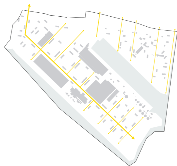
The pioneers activate the entire site, opening up new connections with the rest of Trelleborg through their activities.