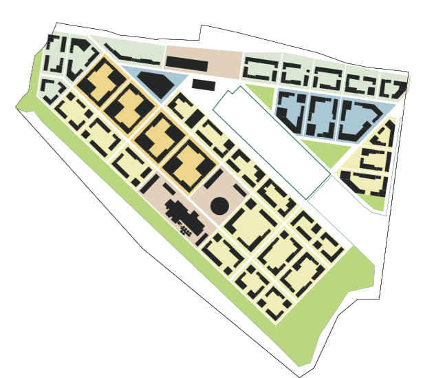
The point grid establishes diverse building footprints and block sizes to generate distinct characters, industry and communities across the entire site, while maintaining coherence.